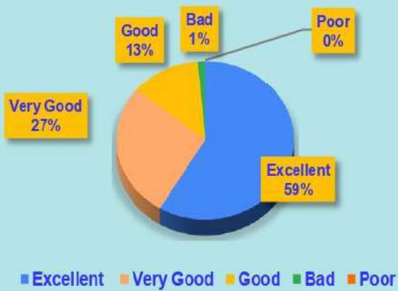
[1/9] Academic Procedures