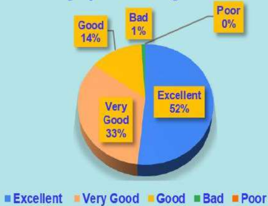
[3/9] Academic Rigour