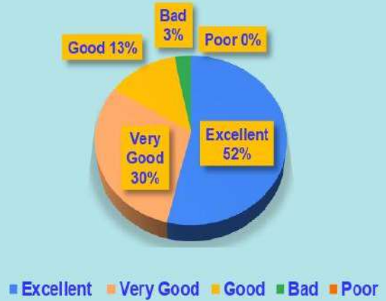
[2/9] Infrastructure and Lab Facility