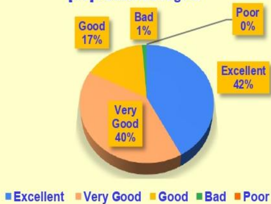
[3/9] Academic Rigour