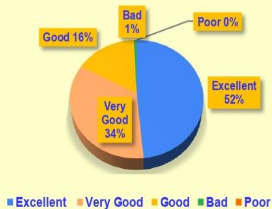
[2/9] Infrastructure and Lab Facility