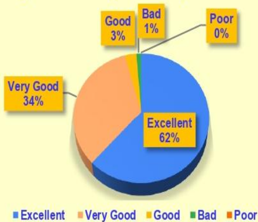
[7/9] Students' Counseling and guidance during COVID-19 pandemic