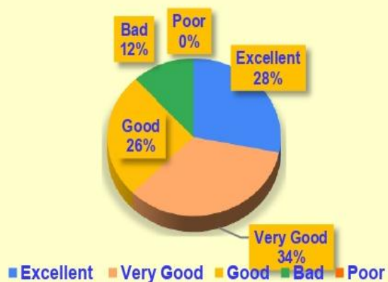
[1/9] Academic Procedures