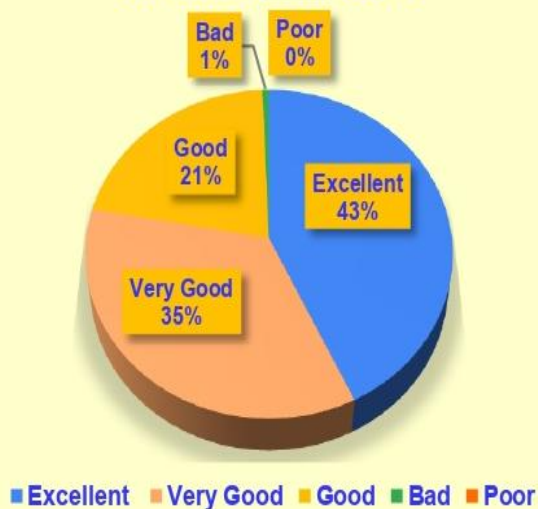
5. The teacher's approach to teaching can best be described as