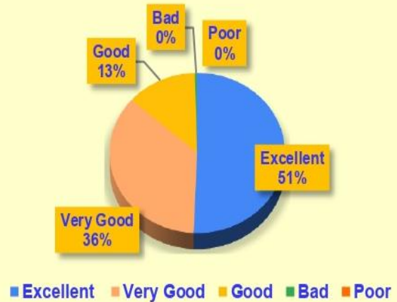
2. The percentage of syllabus completed in the class