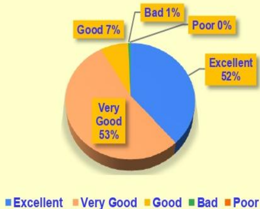
3. Did the teachers come well prepared for the class?