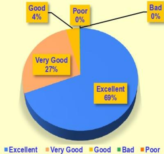
1. Students' Counseling and guidance during COVID-19 pandemic.