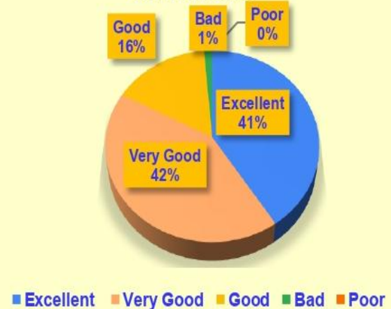
4. How well were the teachers able to communicate?