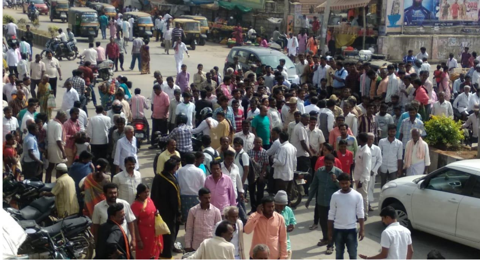
Activity was published in Prajavani News paper.

Our unit conducted awareness program regarding traffic rules in Bagepalli (Bagepalli is located 100 km away from Bangalore) .We demonstrated road accident demo and created awareness to the public like vehicle parking, wearing a helmet, and to follow the traffic rules on 17-12-2018. These activities are done in collaboration with local Government Hospital, Municipal office and local Police station.